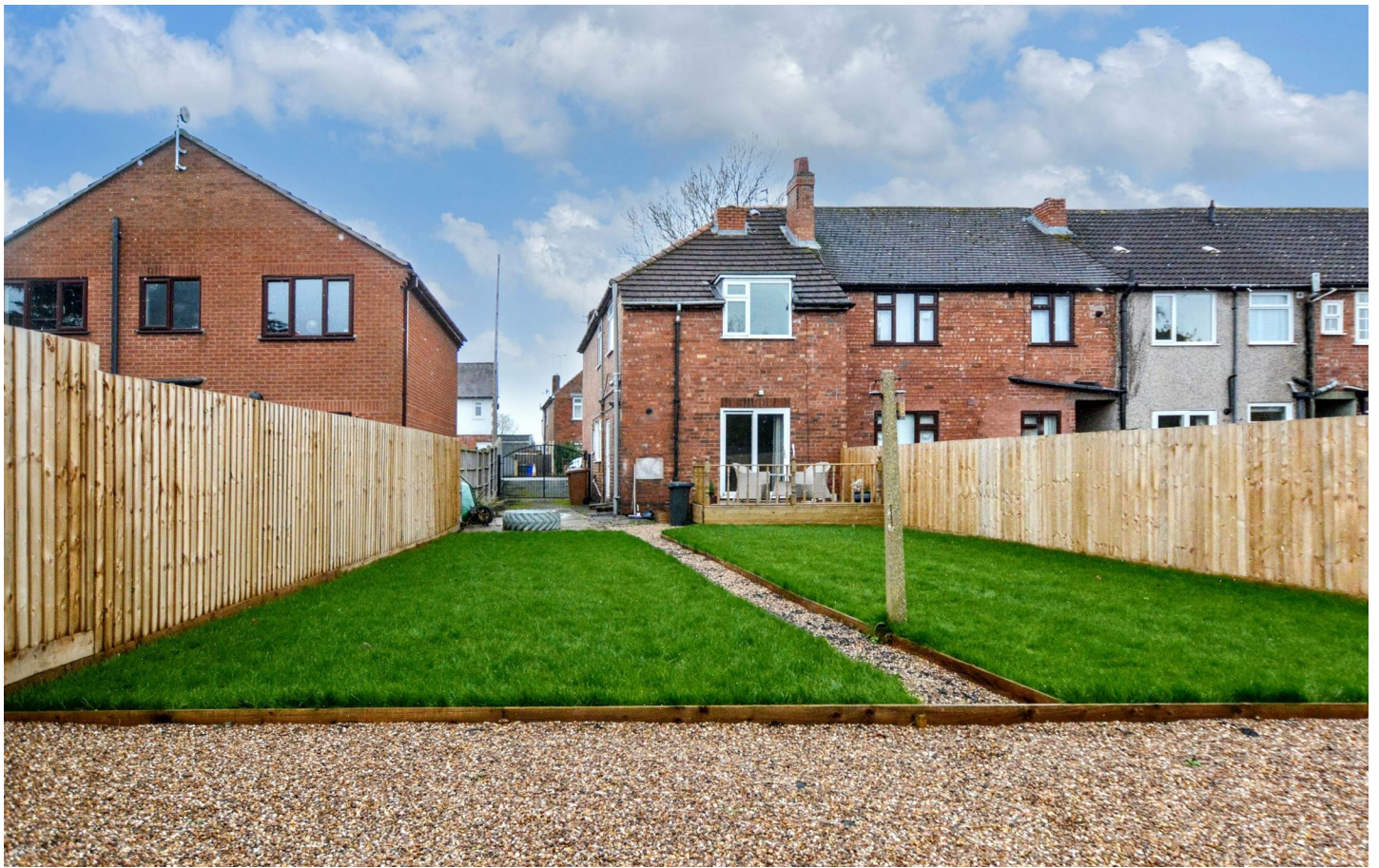
A THREE BEDROOM END PROPERTY FOUND ON A CUL-DE-SAC, IN NEED OF UPDATING AND MODERNISATION.

This three-bedroom end-terrace property is situated on a quiet cul-de-sac in the popular town of Long Eaton, conveniently located within walking distance of Long Eaton train station, local shops, and well-regarded schools. The property requires updating and modernisation throughout, offering an excellent opportunity for buyers to personalise and add value. With its end-terrace position, the home benefits from additional space and presents strong potential for extension, subject to the necessary planning permissions. Offered for sale with no upward chain, this property represents an ideal purchase for first-time buyers, investors, or those looking for a project in a highly convenient and sought-after location.